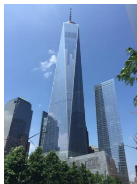
One World Trade Center