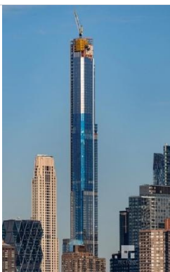
The Central Park Tower

tallest building in the Western Hemisphere and the 23rd-tallest building in the world. The Central Park Tower at 1,550 feet is the tallest residential building in the world. It was completed September 2019. One World Trade Center at 1,776 feet (also known as One World Trade, One WTC, or Freedom Tower) is the main building of the rebuilt World Trade Center complex in Lower Manhattan. One WTC is the tallest building in the United States, the tallest building in the Western Hemisphere, and the seventh-tallest in the world. The 2,717 feet tall Burj Khalifa in Dubai has been the tallest building since 2008.